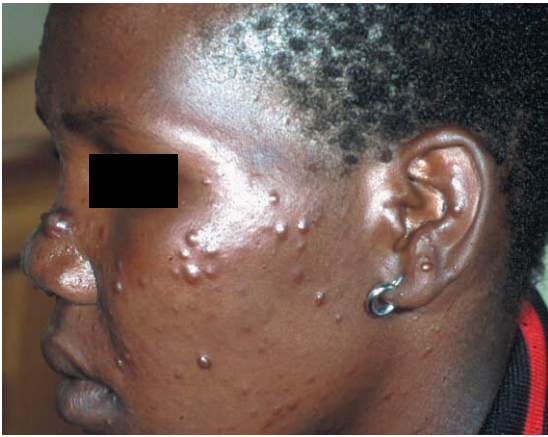
Figure 1A. Histoid leprosy. Figura 1A. Hanseníase históide.