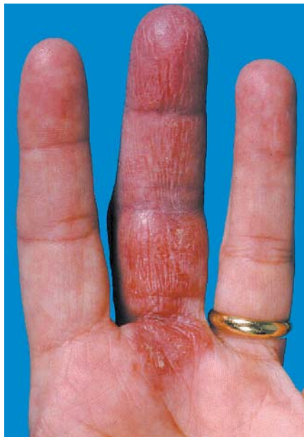
Figure 4. Erythematous infiltrated middle finger. Figura 4. Dedo médio infiltrado e eritematoso.