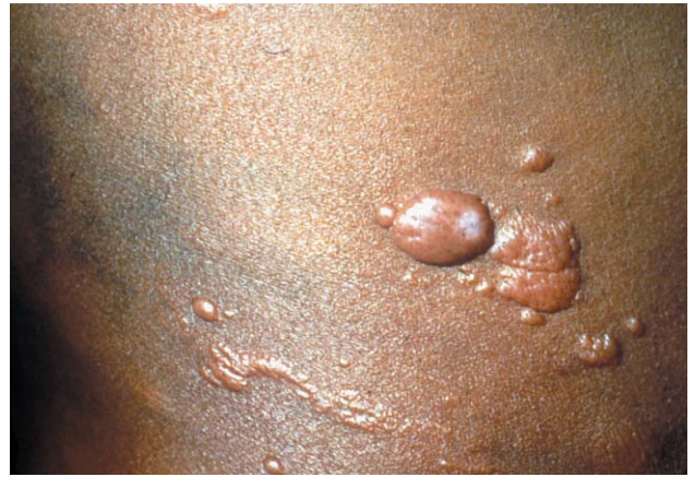
Figure 1B. Histoid leprosy. Figura 1B. Hanseníase históide.