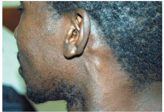
Figure 3. Enlarged cervical nerves. Figura 3. Espessamento de nervo cervical.